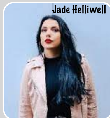
New Years Eve