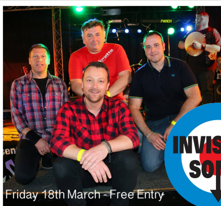
Friday 18th March - Free Entry